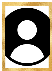
Bonus Speaker TBD

Real Health from the Inside Out: How Your Nervous System Shapes Your Energy, Healing, and Life